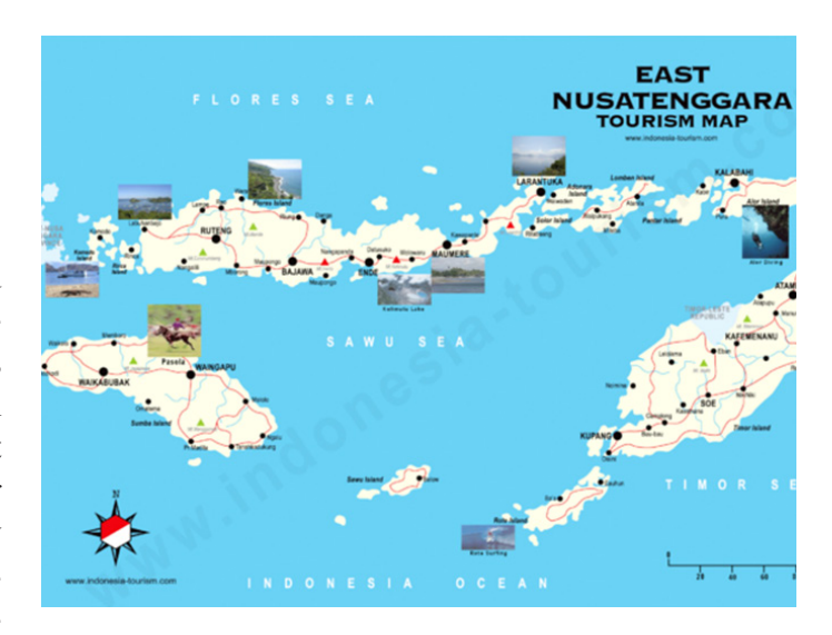
Picture 1: East Nusa Tenggara Tourism Map

"...traditional ceremonies like the Pasola of Sumba, the whip fighting of Flores and the war dances of Sabu. See the prehistoric Dragons of Komodo, the three colored crater lakes of Keli Mutu in Flores; dive in the world renowned diving destinations of Alor and Komodo; surf the waves of Rote and Sumba..."