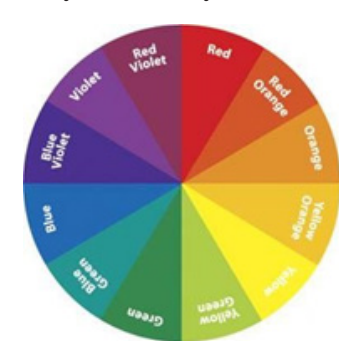
Figure 1. Color wheel

Edwards (2004) wrote that Albert Munsell is a made the color wheel system based on physic knowledge. The color of wheel consisted of 3 colors category are primary, secondary, and tertiary.