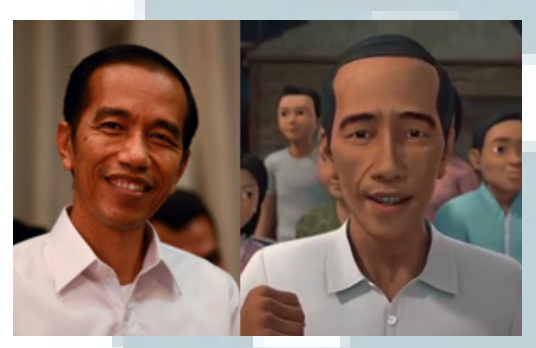
Fig 26. Comparison of Jokowi in Animated Version and The Real Photo, retrieved from: http://sumutpos.co/wp-content/ uploads/2014/07/Jokowi.jpg

Although this animated TV series still hasn't defeated the popularity of imported animation, it has slowly taken its place in the heart of Indonesian audience.