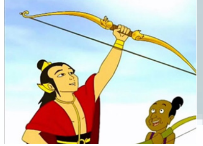
Fig 11. Character Design of Prince Palasara in Dancow's Folklore Series, retrieved from: https://www.youtube.com/ watch?v=66ozGT1MUz8

In the 2000s, Indonesia still didn't have an iconic animated series. But in fact at this time there are several important achievements such as: the animated Indonesia folklore which were packaged as a gift for a milk product (Dancow) were quite managed to get the attention of the audience and was aired on television. The character design was influenced by the trending visual style at that time which was the Japanese animation