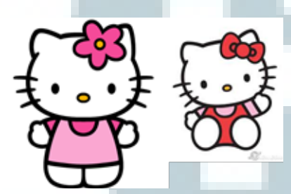
Fig 2. Hello Kitty

Very simple, easy to remember, but not too expressive.