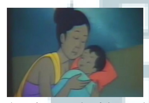
Fig 10. Character Design of Timun Mas' Mother and Baby Timun Mas in Folklore Series, retrieved from: https://www.youtube.com/watch?v=b_eIjWoxRQM

The characters in the folklore series were always different for each episode but the design concepts were the same. The design was too generic so it's easily forgotten. Similar with the character design in Si Huma, it relies on outlines and colors with virtually no shading, but with more complex forms.