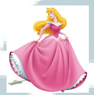
Fig 6. Aurora from The Sleeping Beauty

Has very realistic facial expressions, acting, and anatomy in order to connect with the audience.