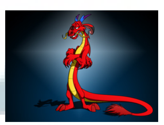
Fig 5. Mushu from Mulan

Not having too prominent facial features, but able to create humor from acting and dialogue.