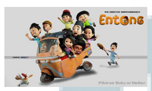
Fig 18. Uwa and Friends Characters

Si Entong is an adaptation of live action TV series of the same title. The story revolves around the life of a little boy named Entong and his friends.