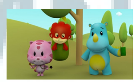
Fig 18. Uwa and Friends Characters