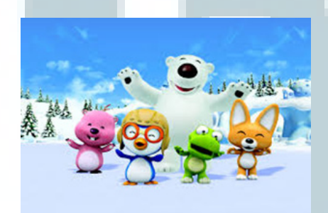
Fig 19. Characters in Pororo The Little Penguins, retrieved from: http://cartoonsimages.com/sites/default/files/field/ image/Pororo-et-tous-ses-amis.jpg

Compared to other existing Indonesian animated series, the style is very different. The character designs are very cute and really suits the concept. But by seeing the character designs and the visual of the animation, we can immediately see how the design was heavily influenced by South Korean preschool animated series Pororo The Little Penguin.