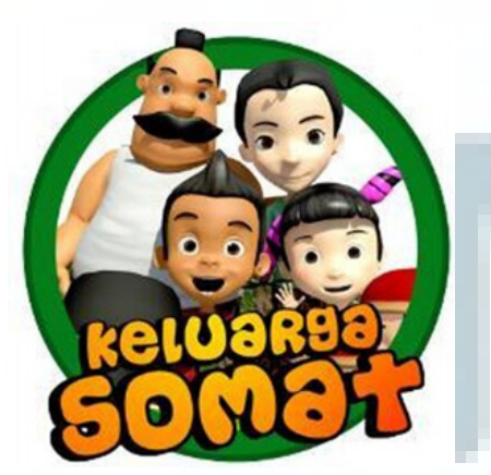
Fig 23. Characters in Keluarga Somat Series

The story is about the simple but unexpected life of Mr. Somat and his family in the diverse neighborhood background.