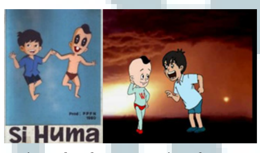
Fig 8. The Character Design of Huma and Windi, The First Animated Series in Indonesia, by Andri.H, 2012 April 22, retrieved from: http://upload.wikimedia. org/wikipedia/id/da/Huma dan Windi.jpg

The 80s period can be regarded as the golden years of animation Indonesia. At this time a lot of animation studios were founded in various regions in Indonesia and animated films which are still frequently discussed up until now emerged, such as: Rimba Si Anak Angkasa (Rimba The Space Boy) by Wagiono Sunarto, or Si Huma (1983) initiated by PPFN (Perum Produksi Film Negara/ National Film Production). At that time, the character designs in the animations were limited by technology so that its form is simple, relying on outline (Line) and colors with virtually no shading. The design of Huma character was inspired by the appearance of Indonesian children at that time. Although the design is unique, I find it not pleasant enough aesthetically.