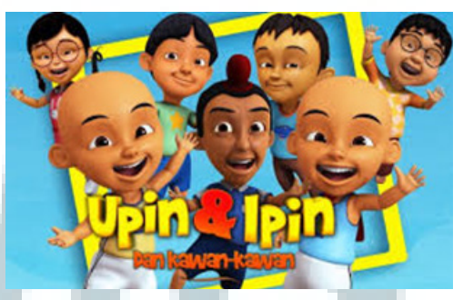
Fig 12. Upin & Ipin Characters

Animation schools became very popular and eventually increased in number and quality across the country. Animation festivals like Hellomotion, INAIC-TA, and Animafest also contribute in encouraging young animators to produce animated films. Their background and new technology affect the character design in their animation.