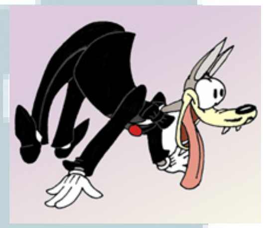
Fig 4. The Wolf from Tex Avery Cartoon

More expressive than the two previous hierarchy. Not designed for dialogue, which highlighted the movement and expression that are likely to have facial features, so exaggerated impression of the cartoon humor can be achieved.