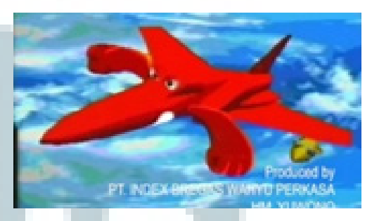
Fig 9. Some of The Characters in Hela-Heli-Helo by HM Yuwono