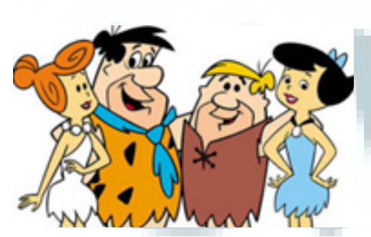
Fig 3. Characters from The Flintstones

Simple but has more expressive facial expressions. 3.)