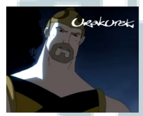
Fig 13. Character in Mahabharata Animated Series Retrieved from: https://www.youtube. com/watch?t=120&v=2eaNyiS1IGc

This animated TV series is an adaptation from a comic book by Indonesian famous artist, R.A. Kosasih. R.A. Kosasih is well known for his comics that depict Wayang stories.