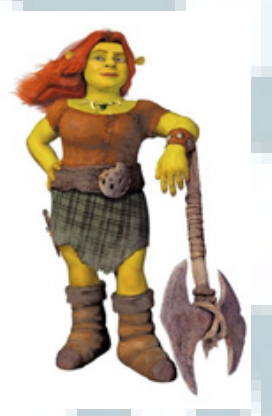
Fig 7. The Princess from Shrek

This is the most realistic type of character but still have the element of caricature in its design.