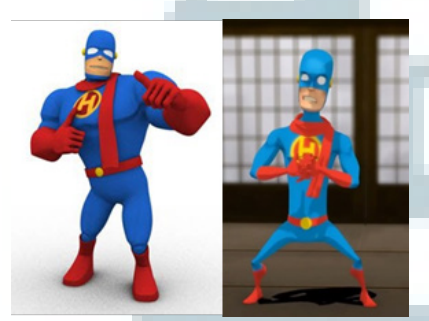
Fig 16. Hebring 2009 (left) and Hebring 2015 (right) by Andi S Boediman, retrieved from: https://andisboediman. files.wordpress.com/2009/10/hebring. jpg?w=216)

Si Hebring is a story about local superhero who is a bit absurd and funny. Si Hebring was first appeared as sequels in animation festivals but later aired in TV stations.