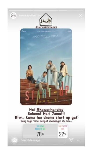
Picture 5. A Harvies polling featuring Korean drama Start Up characters on @harviescoffee's instastory

Seeing the enthusiasm and response from his followers, Harvies then proceeded to the next stage of inserting the drama materials and hooking them with Harvies products, to enter the core of the campaign that provides special packaging with additional stickers of start up drama characters every purchase of all Harvies products while sticker supplies are still there.