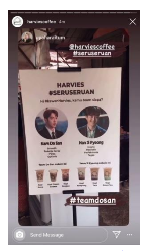
Picture 6. Campaign sticker featuring Korean drama Start Up on Harvies product