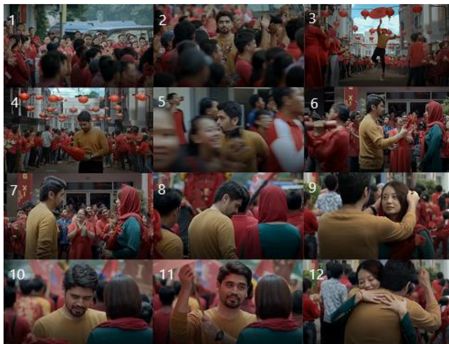
Figure 7. Episodic Sequence – 01.22.53, 01.23.18, 01.23.29, 01.23.33, 01.23.41, 01.23.54, 01.24.07, 01.24.45, 01.25.01, 01.25.09, 01.25.10, and 01.25.18

The closing part of the film “ Bidadari Mencari Sayap ” includes assurance when Reza, who left Angela, returns and wants to start again. The umbrella that Reza took was a substitute for the umbrella gift that Reza gave him, which was broken when they fought. The shots in this scene can be categorised as episodic sequences due to the complete depiction of events, starting from Reza appearing from the crowd and looking for Angela, taking the umbrella, closing the umbrella, running towards Angela until they hugged.