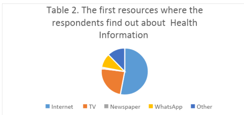
Table 2. The first resources where the respondents find out about Health Information

The descriptions of the respondents' demographics can be found in Table 1. A total of 325 female respondents, or an equivalent of 67%, and 160 men, or an equivalent of 33%, had completed the questionnaire. The division of this generation is based on the development of communication and information technology that comes with the time of birth for each generation. The first generation of Generation Y was born in 1980 in which Helsper and Eynon said that at that time, Facebook and MySpace gave birth to the second generation, namely digital natives (Helsper & Eynon, 2010). Digital natives refer to those knowing the internet only to the extent of their social and participatory functions (Fuchs, 2011). The new digital native is characterized by a more reachable Internet in which mobile phone technology is synchronized with the Internet (Amalia Ferniansyah, Siti Nursanti, 2021). Therefore, those present in this century can read the information via the internet, produce a report, and share it with others.