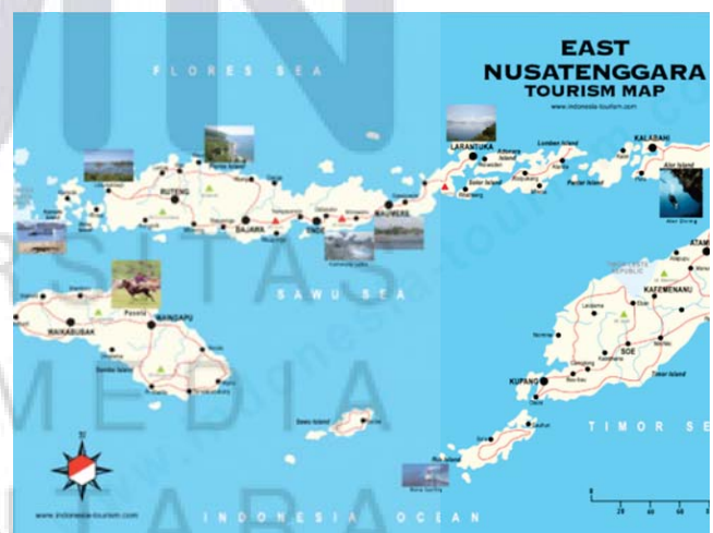
Picture 1: East Nusa Tenggara Tourism Map

From all tourist destinations located in Flores, the uniqueness of the Komodo