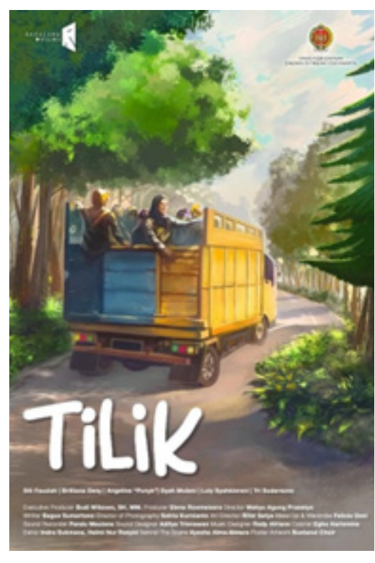
Figure 2. Tilik Movie Poster

Tilik tells the story of a group of women who travel by truck to visit the village head who is being treated at the hospital, along the way the women chatter and gossip. This is considered very relevant and describes the figure of mothers who are often found in the surrounding environment. Films like this besides being able to attract attention, discussion, and praise, can also provide lessons in life for self-assessment and are able to open minds to make people aware of bad incidents that still happen frequently and should not be imitated.