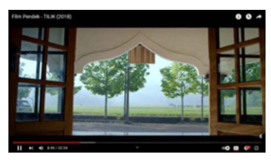
Figure 11. Scene when the group stops at a mosque

If seen from the visual display in minute 8:49 as can be seen in Figure 11, components shape which stand out and are clearly visible can be found on the door of the mosque, which has basic shapes such as squares and rectangles.