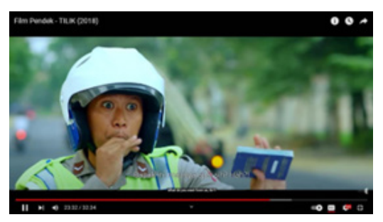
Figure 14. The scene when the police give a ticket to a group of women who are going to visit the lurah

This can be seen in the scene at minute 1:41, shown in Figure 13, which uses reflective control because it has the same lighting intensity in each scene and uses tone control through props, namely the truck that the women are riding, the clothes and the location used. By controlling the tone of the props, clothing and location, they are able to support the appearance of the short film Tilik, which well present the atmosphere of the day.