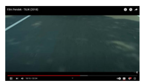
Figure 8. Scene while on the go

In the scene at minute 18:10, the technique uses an unusual camera angle so that it can disguise the actual space of a known location or object as can be seen in Figure 8.