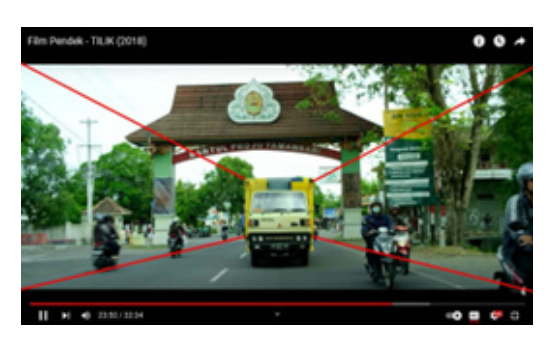
Figure 4. Scene when the truck is on its way

Then according to the size of the image or object, shooting in that scene uses a medium long shot which shows all the objects but on the actor's body half is visible from the knees to the head. The impression generated from this medium long shot is to clearly record the neutral body movements of the women who are in the