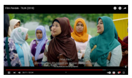
Figure 6. The scene when the group of mothers arrived at the hospital and were talking with the village head's daughter

Flat space is a visual component that defines the two dimensions of the actual screen surface.