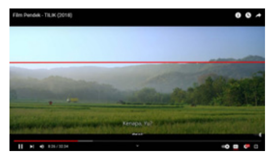
Figure 10. Scene when the group stops in the middle of the rice fields

The line visual component is a very important visual element because it can control space, movement, and rhythm. Component lines this can be seen through the differences in tone and color. Lines can be revealed or hidden depending on the tone against the backdrop (Blocks, 2021).