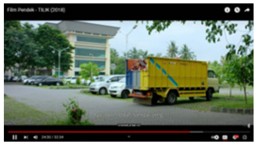
Figure 12. Scene when the group arrived at the hospital parking lot

In Figure 12, the basic shapes that stand out and look detailed, namely on the hospital building, the truck body, and the floor of the hospital parking lot which have square and rectangular shapes.