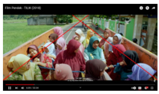
Figure 3. The scene when the group of women boarded the truck to go to visit the lurah

most effective depth guide (Blocks, 2021).