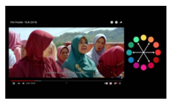
Figure 15. The scene when the group of women boarded the truck to go to visit the lurah

reaches 90% using complementary colors. The selection of complementary colors is used to display a dramatic contrast, namely warm and cool. The choice of color can support the storyline, namely gossip scenes interspersed with feuds in the short film Tilik.