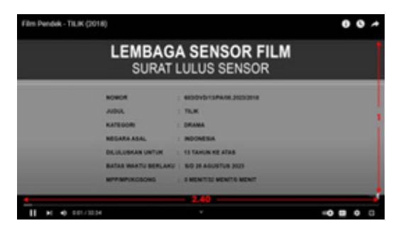
Figure 9. Preliminary view of the film censorship agency's description

numbers indicating the proportional relationship between the width and height of the screen or spaces, not the actual screen dimensions (Block, 2021).