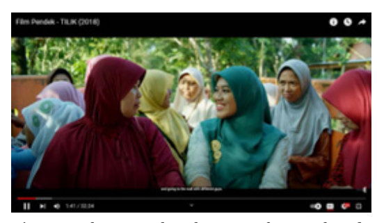
Figure 13. The scene when the group of women boarded the truck to go to visit the lurah

Tone in the basic visual component of cinematography mentioned is the lighting or brightness of objects. To implement the tone in the film, there are several techniques, namely controlling tone, coincidence and non coincidence, and contrast and affinity (Blocks, 2021).