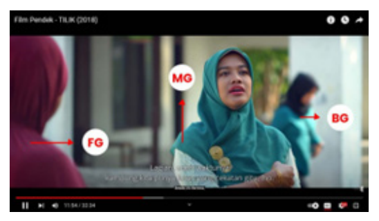
Figure 7. Scene when a group of women stopped at the mosque to go to the bathroom

tion of layouts that have a unique visual quality that can be distinguished from deep space and flat space.