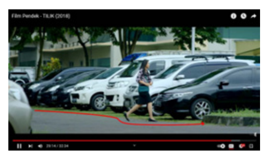
Figure 18. Scene when Dian walked towards the car of the lurah's husband's

In the screen world every moving object generates a track. Tracks are paths created by moving objects. In the scene at minute 29:14 shown here in Figure 18, it can be seen that there are shots that follow the movements of the actors. It can be seen that technique or camera angle used is eye level so that it is at eye level with the audience. Meanwhile, when viewed from objects that are in frame the type shot used is long shots which serves to display a wide panorama in a frames and as shot opener before use shot which is closer. The use of long shots on scene is to display the movement of actors walking from a distance until they enter the car, then shot will be directed closer to the actor Dian.