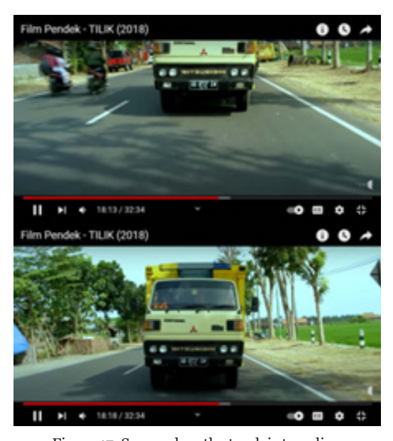
Figure 17. Scene when the truck is traveling

Figure 17 is the scene at minute 18:13 to 18:18 which show a visual component of movement based on the camera movement. Where the camera movement technique used is tilt up technique, which is the technique of taking pictures by rotating the camera from the bottom up.