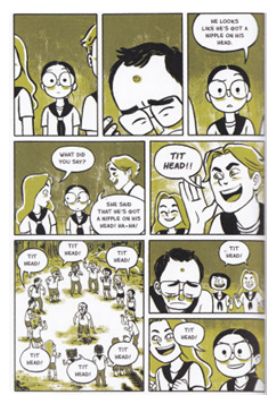
Figure 7. Vera's stage of imitating

Vera is accepted back into the camp's social environment after she imitates the older children's behavior by bullying her weaker friends. When she bullies the weak, Vera feels that she has an outlet after being pushed aside by the others, even though she feels that this was wrong. An illustration of Vera's behavior, when she participated in bullying her friend, can be seen on Figure 7.