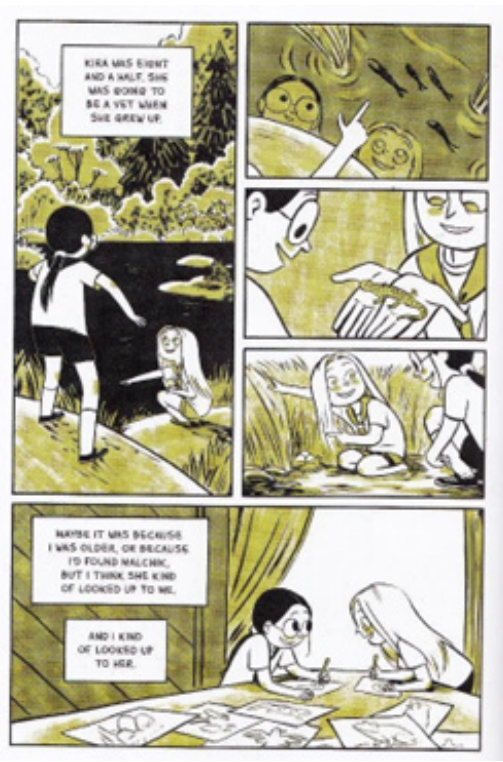
Figure 8. Vera's integrated stage

The change in behavior experienced by Vera during the summer camp event is a signifying pattern of the stages experienced by transnational children. If seen from the depiction in the graphic novel, these stages can be divided into three stages, namely, the stage of seeking recognition, the stage of imitating, and the stage of integration with the new environment. The stages in seeking recognition occur because transnational children need to understand the context of norms that apply in a new environment. In understanding this context, a transnational child must build connections to receive social assistance. Social assistance can be in the form of real help to complete daily tasks, guidance, and advice from others.