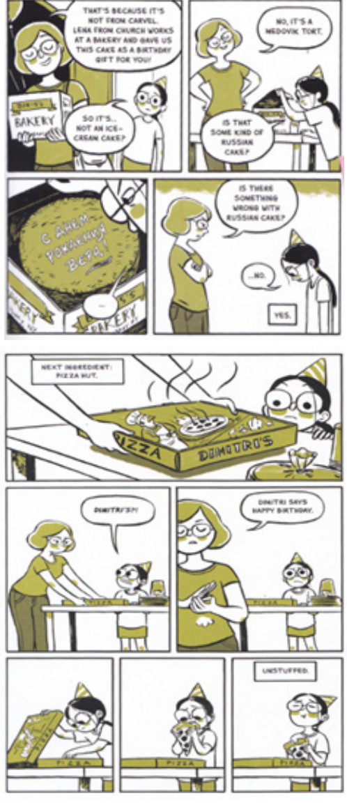
Figure 3. Birthday party of Vera as Russian Immigrant children

Comparing the two birthday parties, the sign of American children's parties and Russian immigrant children's parties become the connotation signifier of cultural acculturation expectations. Cultural acculturation expectations are attitudes expected from the immigrant when they come into contact with the dominant culture (Berry, 2003). From the presentation