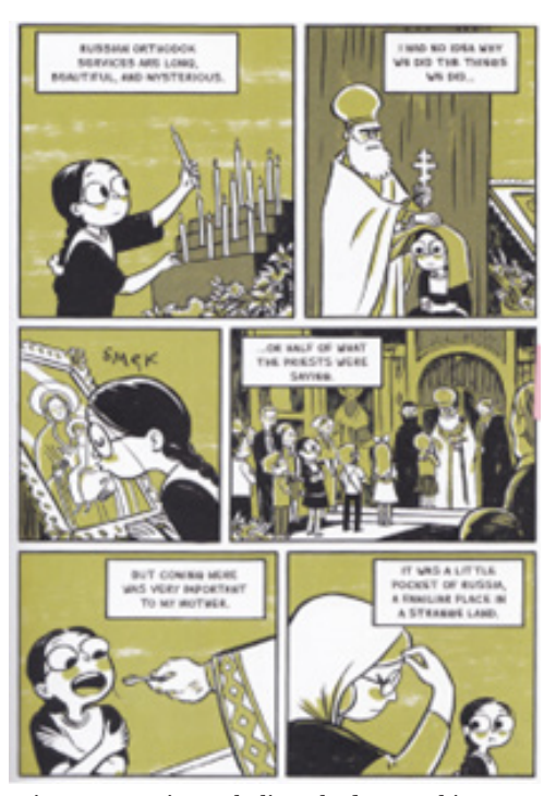
Figure 4. Russian catholic orthodox worship scene with Vera's family