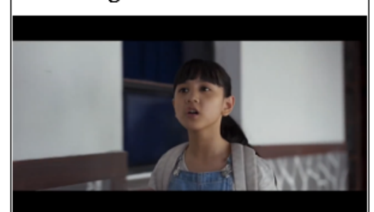
00:05:56 - 00:06:02