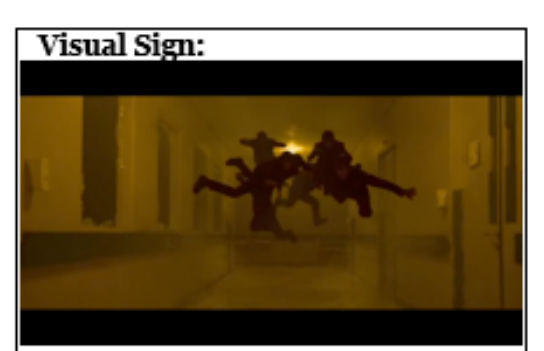
00:45:45 - 00:46:53