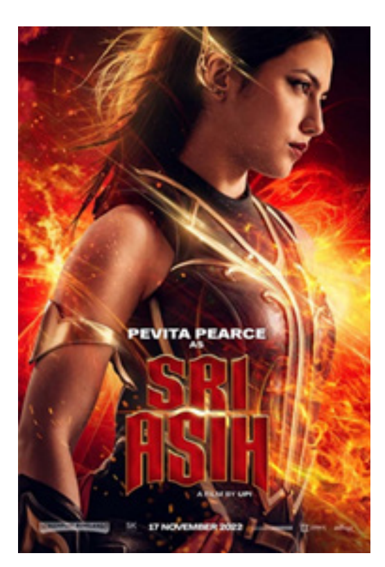
Figure 1. Sri Asih Film Poster.

Sri Asih (2022) is a film directed by Upi Avianto and written by Upi Avianto and Joko Anwar. The film is produced by Screenplay Bumilangit, a company that produces superhero films based on characters from Bumilangit, a company with a heritage of over 60 years in creating Indonesian superhero characters. The story in the Sri Asih film (2022), as can be seen in Figure 1, presents differences from previous comic book and film versions, providing a new interpretation of the superhero character Sri Asih. This film is part of Bumilangit's efforts to expand and develop the Indonesian superhero universe on the big screen.