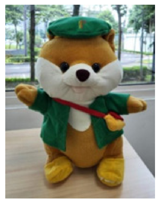
Figure 12. Adita Plushie

Additionally, producing content in the form of products that can be given out to prospective students will also help establish a favourable and attractive image of the character in the market's mind. As Adita's image is of a cute and friendly mascot, the products produced also need to mirror this. Thus, an example of a product that can be used to introduce Adita to the market is a plushie as seen in Fig. 12.