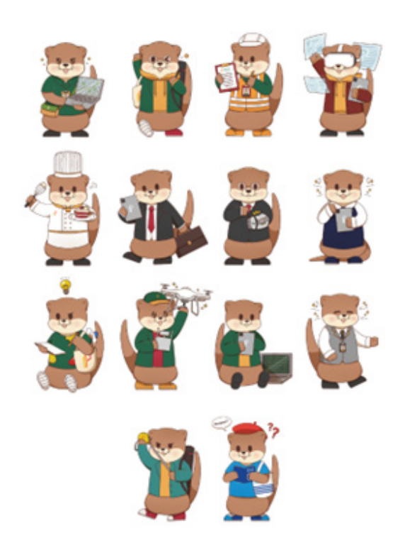
Figure 10. Alternate Attires for Majors (Personal Research Documentation)

Regularly implementing Adita in the university's social platform content will allow the market to be aware of him, in turn increasing his likeability.