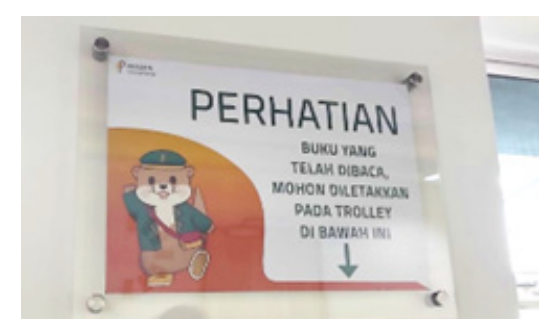
Figure 13. Sign in Pradita University's Library