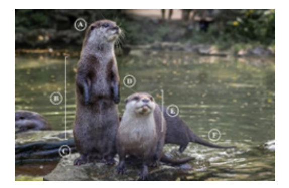
Figure 3. Asian Small-Clawed Otter Anatomy Breakdown