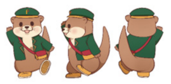
Figure 8. Adita's Character Sheet (Source: Personal Research Documentation)

However, unlike the official blazer with Pradita's logo on the right chest, the logo on Adita's jacket has been moved to his hat to ensure better visibility. In addition to the official blazer of the university, his look is completed with a bag, a hat, and a pair of sneakers as seen in Fig. 8.