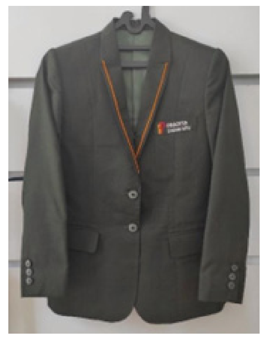
Figure 7. Pradita University's Blazer

To showcase these colours on Adita as well as emphasise his student status, Adita wears a blazer modelled after the university's blazer seen in Fig. 7.