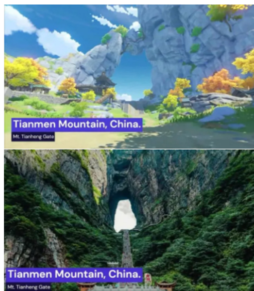
Figure 4. Comparison of ingame and real-world visuals