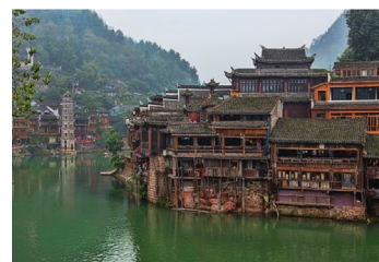
Figure 3. Scenery in Fenghuang ancient town Hunan China

Liyue, a region in the Chinese-inspired game Genshin Impact , conveys a rich and inclusive cultural feel. Carefully, miHoYo designed the city of Liyue to represent various aspects of life in China. The buildings' architecture, the city's layout, and the background music that uses traditional Chinese instruments are all carefully crafted to create an immersive and authentic experience for players (Feng, 2024). The creation of Liyue took a duration of twelve months and the history of its design is sourced from ancient China, with references from artistic to China's Zhangjiajie National Forest Park, the Scenic area in Huanglong district, the Guilin landscape, the Fenghuang Ancient district, and the Hanging Temple in Shanxi district (Cai et al., 2023). These settings have been positively received, praised as symbols of Chinese culture in the game.