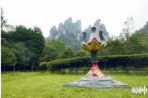
Figure 5. Genshin Portal in Zhangjiajie National Park

Genshin managed to elevate the beauty of China in the eyes of global players. This is especially true for Liyue who stands as an example of China and its culture in the eyes of the world. The availability of Genshin Impact on various platforms such as the App Store, Play Store, PlayStation, and other consoles supported the creation of a large player base and a tight-knit community worldwide, thus expanding its reach far beyond the borders of China and making it extremely popular around the world (Wang, 2024). For players from those regions who are unfamiliar with China and its people, Genshin Impact has increased their curiosity about the country, its wonderful cultural heritage, and the beautiful scenery it offers. Genshin's wide player base is also a great market for introducing Chinese tourism. The game's visuals have also attracted players to visit real-world locations.