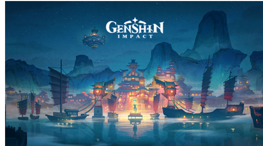
Figure 2. Liyue Genshin Impact in game

formal educational tool. Genshin Impact can be a gateway for players to learn more about various aspects of Chinese culture by presenting cultural information in a fun and easily digestible form.