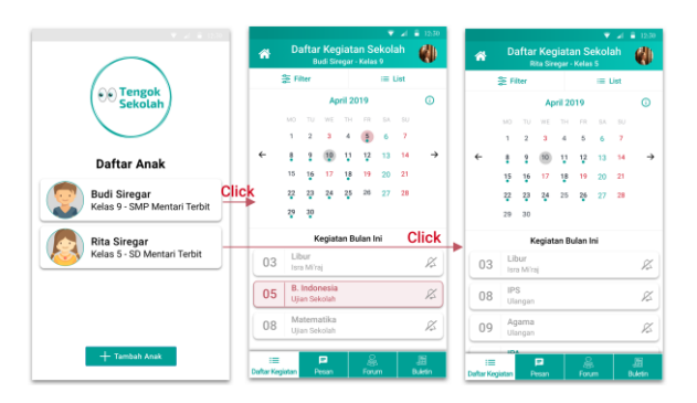
Fig. 6. Split Child Activity Task on High-fidelity Prototype