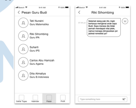
Fig. 2. Teacher Conv. Room on Low-fidelity Prototype

Consistency was tried to be applied when designing this prototype. With consistency, we help users to easily learning every page. To maintain the consistency, every main page has a title at the top and navigation bar at the bottom. At the middle is the main information that will show base on the chosen menu at navigation bar. This consistency thing supported by the chosen navigation model, hub and spoke that shown by navigation bar. Hub and spoke with navigation bar is commonly used by mobile application.