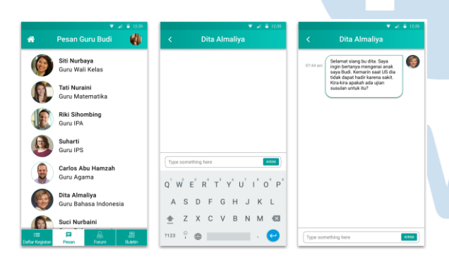
Fig. 5. Teacher Conv. Room on High-fidelity Prototype