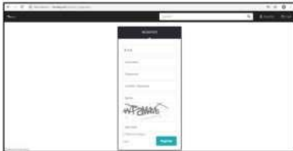
Fig. 3. Register page of ibudaya.id

If a user want to join, then the user must register first. To register, the user should click the Register menu at the upper right of the display. After clicking Register menu, then appear Registration display as Figure 3.