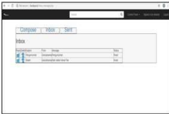
Fig. 8. Messaging menu for communications

When we click the Messaging Menu, then appear Messaging display as shown in Figure 8. In this Messaging Menu, a user can compose a message that will be sent to other user, by clicking Compose Menu. And also the user can check whether he/she get a message from other user(s), by clicking Inbox Menu. He/she also can check what messages that he/she has sent to others, by clicking Sent Menu.