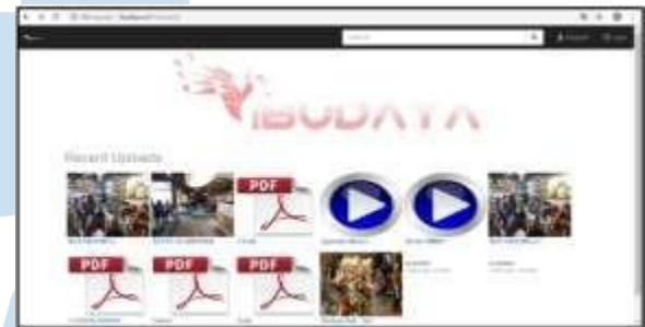
Fig. 1. Example of a figure caption

The first time we enter the portal website ibudaya.id then we will have a display as above picture in Figure 1. There are some menus at the upper right of the display, such as Register and Login.