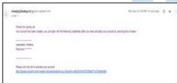
Fig. 4. Notification e-mail for user account activation

In this Registration menu, the user must fill: email address, user name chosen, password, Name, captcha code. And to confirm, the user must click Register button. After clicking the Register Button, the user will be informed that he/she will get an email, contains notification to activate her/his account. In the email, there is an address to be click to activate the user account, as shown in Figure 4.