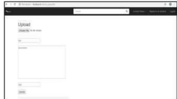
Fig. 6. Menu for user to upload document

From Home Page menu, the user can upload a document by clicking the Upload Menu, as shown in Figure 6.