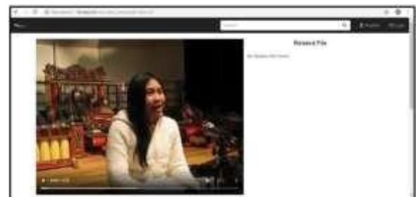
Fig. 2. Playing the content

If the user just want to see the contents in the portal, then the user can directly view the screen, or scroll the screen to see some contents there, so the user can find some contents by their titles. And then the user can click one of the content icon to see the content completely, as shown in Figure 2.