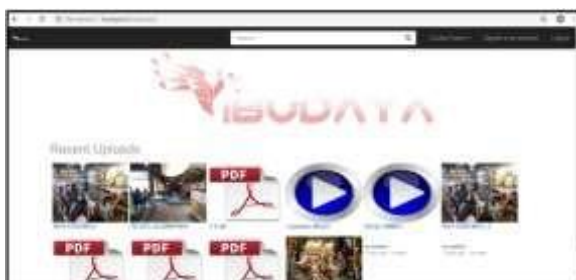
Fig. 5. User view of home page of ibudaya.id after login

After clicking the link to activate in the email, then the user will go to the Home page of the ibudaya.id, as shown in Figure 5.