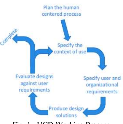
Fig. 1. UCD Working Process

UCD or User-based design is a term used to describe design philosophy. The concept of UCD is the user as the center of the system development process and purpose/nature, context and environment systems are all based on user experience [5].