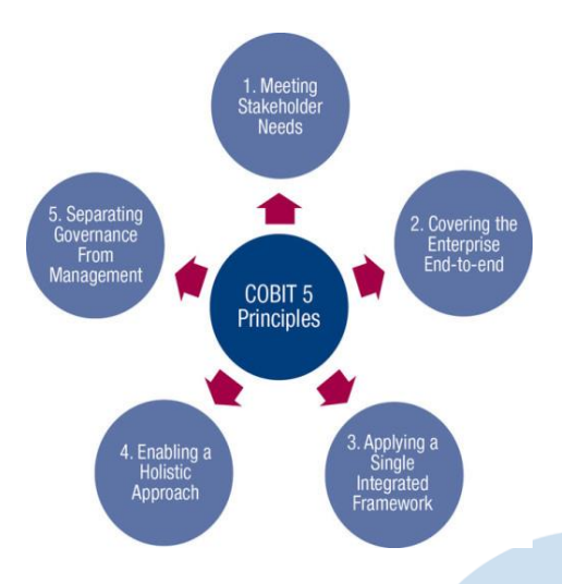
Fig. 1 COBIT 5.0 Principles [13]

approach, and separating governance from management. following the principles of COBIT 5.0 [9]-[11], [13].