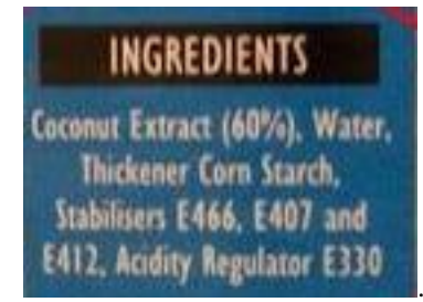
Fig. 7. Uncommon Word