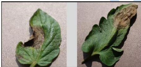
Fig 2. Sample image from dataset kaggle

The dataset used in this research was sourced from the Kaggle repository, specifically the PlantVillage dataset, which contains images categorized into bacterial spot, early blight, late blight, leaf mold, and healthy leaves. Additionally, local data was collected directly from a tomato plantation located in Sragen, Central Java, Indonesia, to test the model's ability to generalize across different environmental conditions and plant varieties.