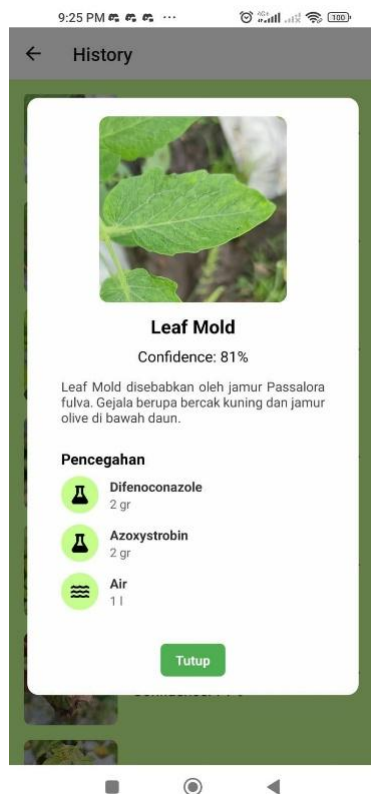
Fig 5. Prediction System

The high accuracy on the PlantVillage dataset demonstrates the effectiveness of the VGG16 architecture under controlled dataset conditions [11]. However, the sharp performance decline when tested on local images reveals a significant limitation [12] in generalization. This supports literature findings that AI models must incorporate diverse and localized training data to ensure robust real-world performance [13]. Future research should focus on collecting and integrating local datasets [14], applying domain adaptation techniques, and continuously fine-tuning models to match field conditions [15].