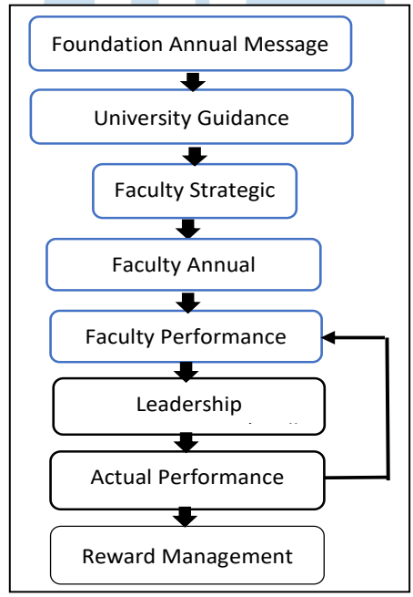
Figure 2. Implementation Model of BSC on the Case Faculty

The framework of the setting up KPIs, contract management and faculty managerial work plan are as describe below: